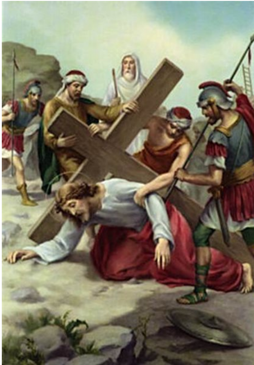
STATION 7: JESUS FALLS A SECOND TIME