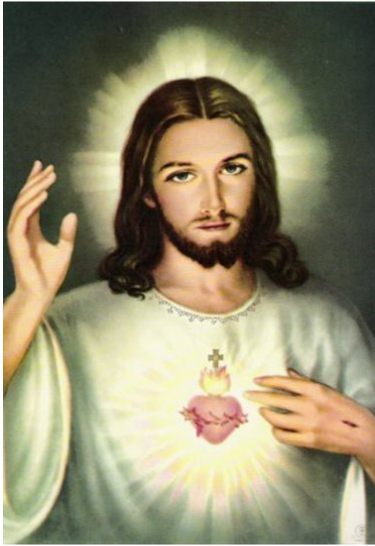
OUR LORD JESUS CHRIST