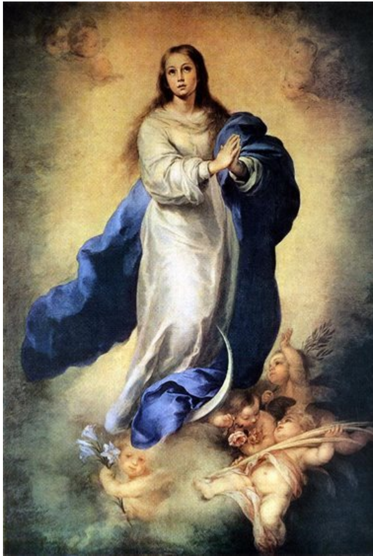
THE ASSUMPTION OF THE BLESSED VIRGIN MARY