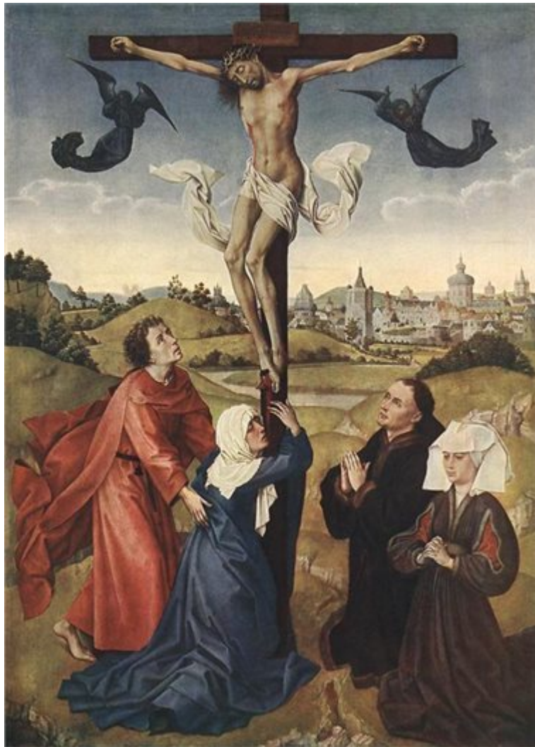
THE CRUCIFIXION OF JESUS CHRIST