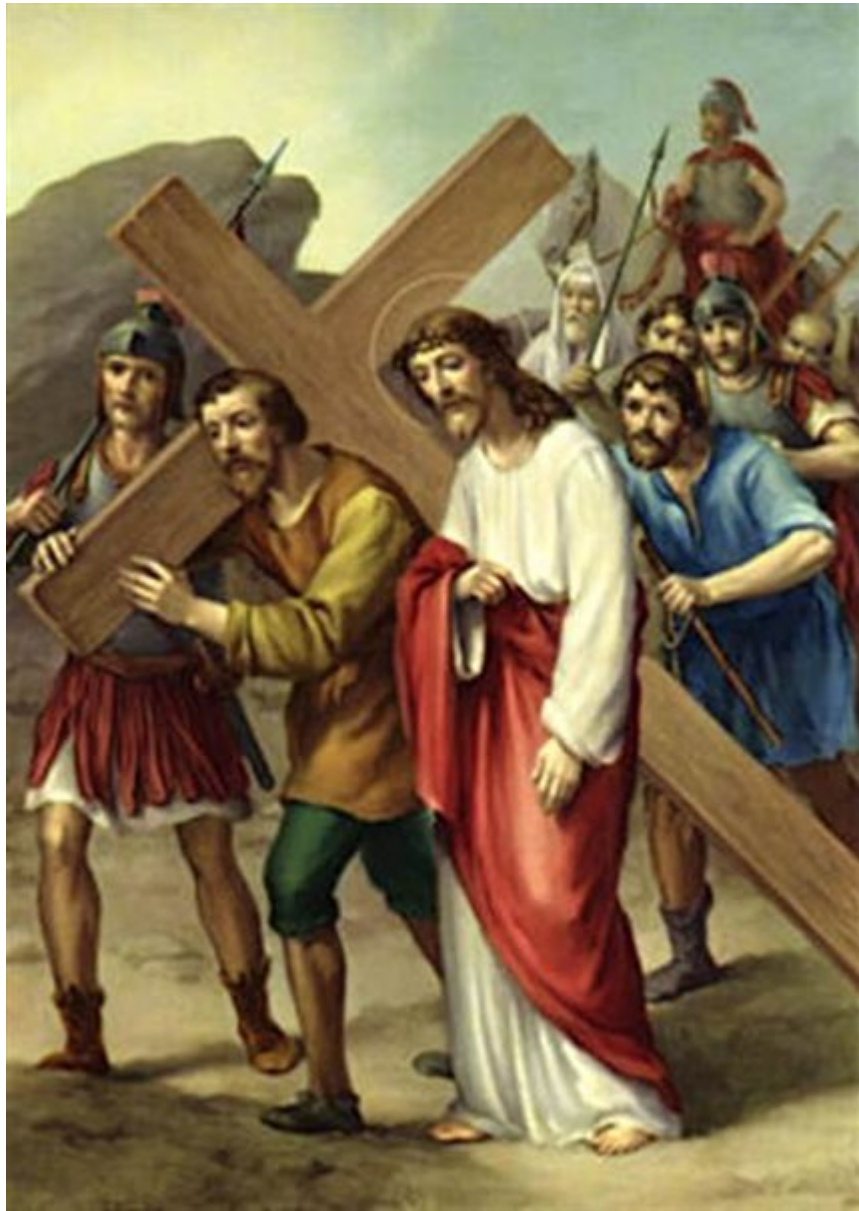
STATION 5: JESUS IS HELPED BY SIMON