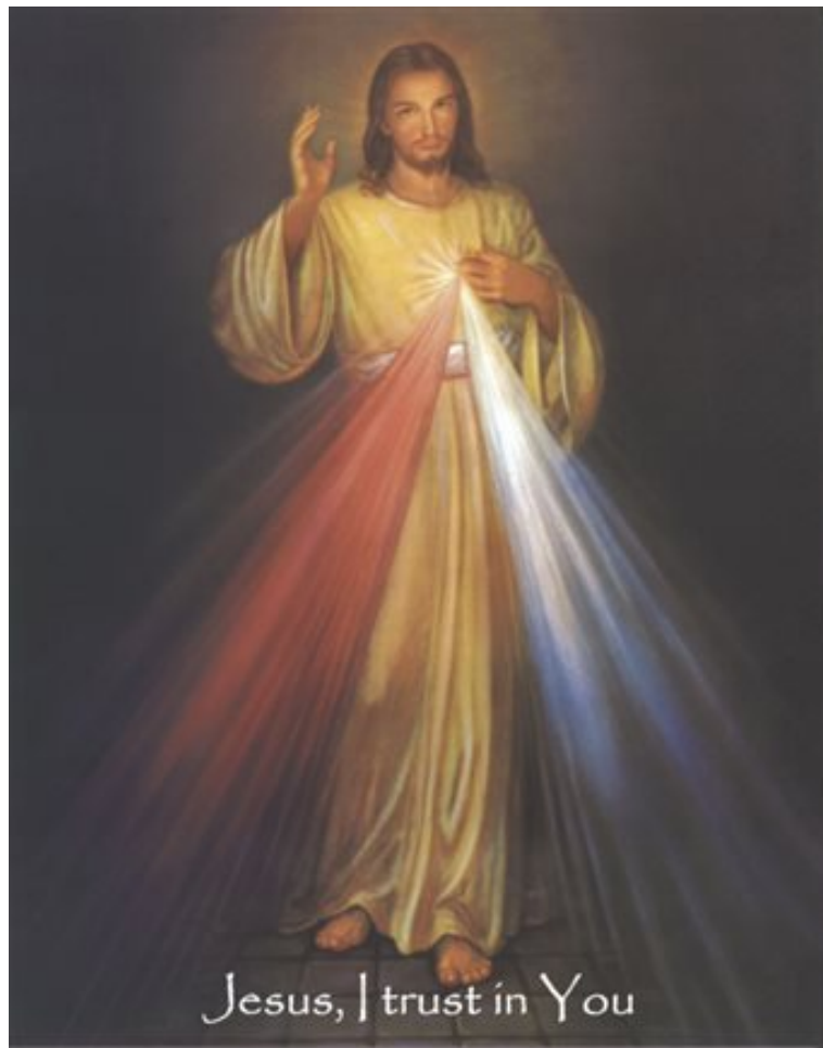
THE DIVINE MERCY IMAGE