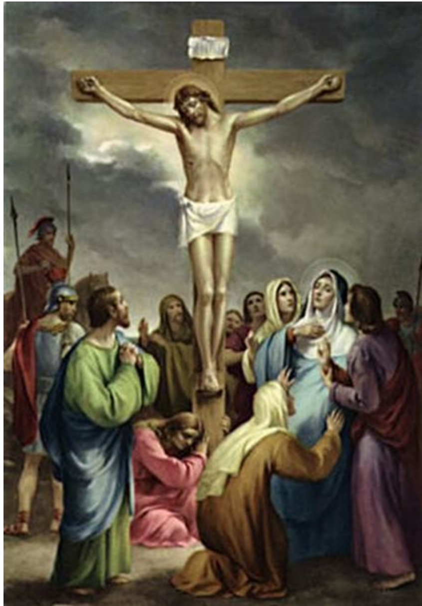
STATION 12: JESUS DIES ON THE CROSS