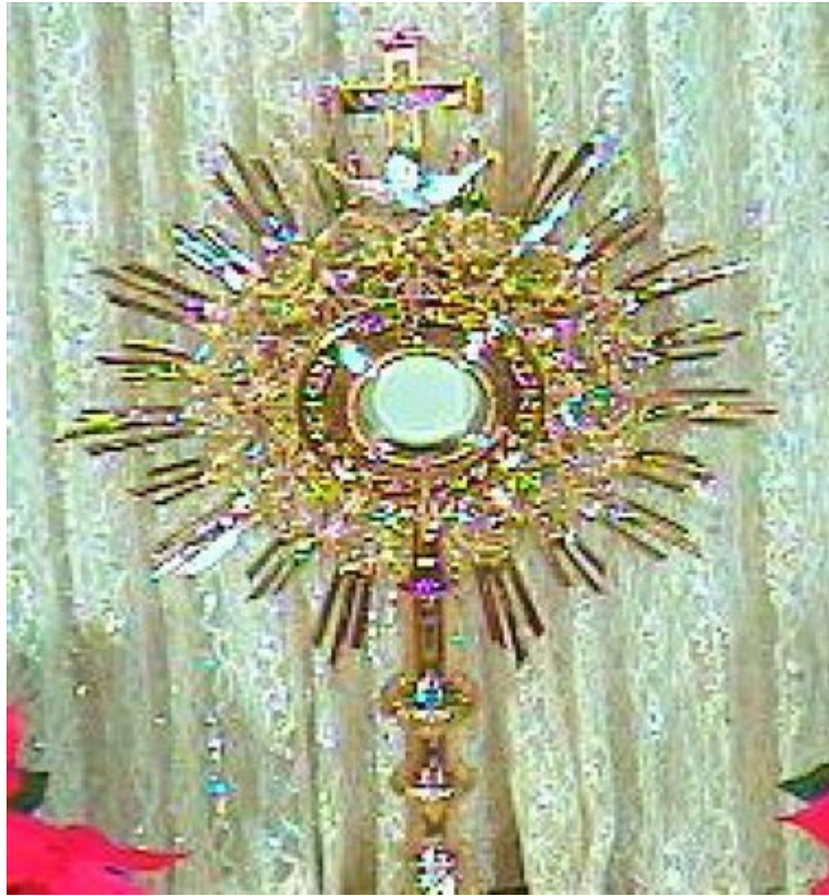
OUR LORD JESUS CHRIST IN EUCHARISTIC ADORATION