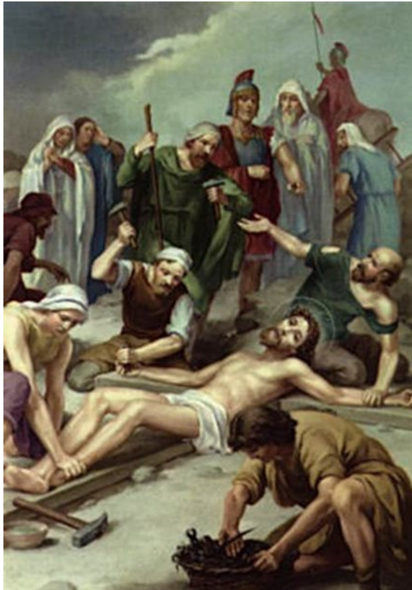
STATION 11: JESUS IS NAILED TO THE CROSS