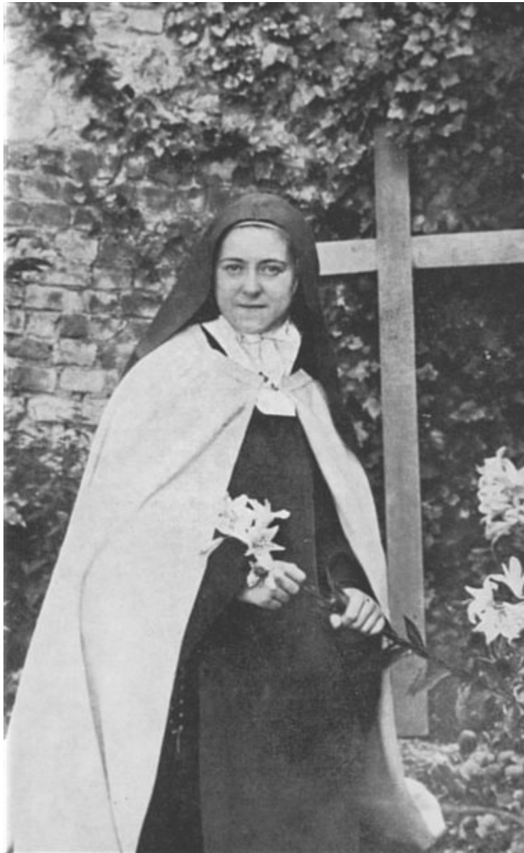
SAINT THERESE OF LISIEUX