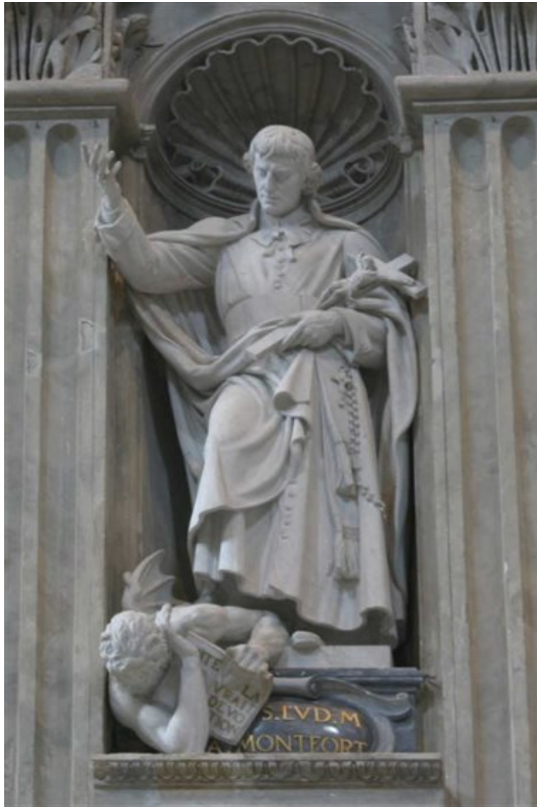
SAINT LOUIS DE MONTFORT