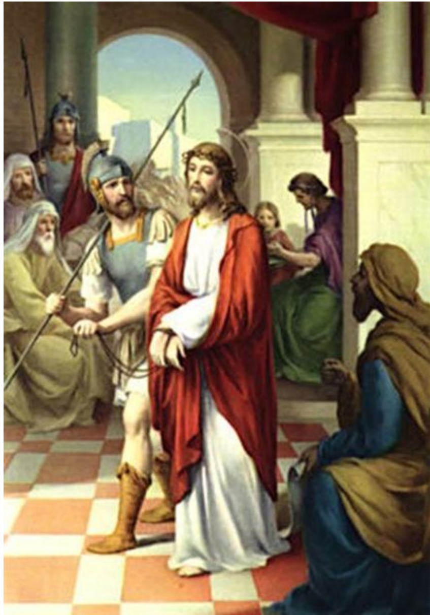
STATION 1: JESUS IS CONDEMNED TO DEATH