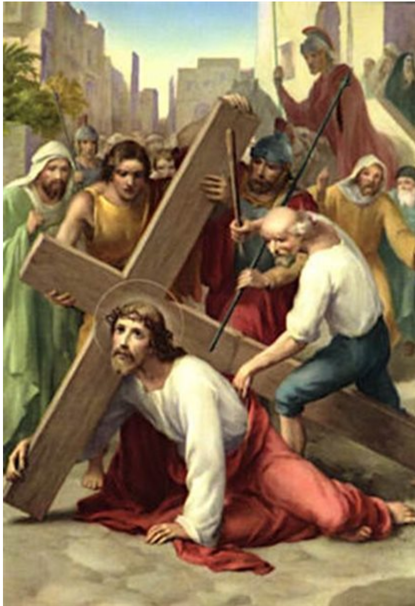
STATION 3: JESUS FALLS THE FIRST TIME