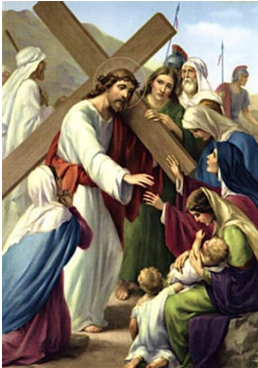
STATION 8: JESUS SPEAKS TO THE WOMEN