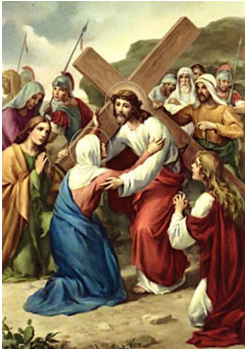
STATION 4: JESUS MEETS HIS MOTHER