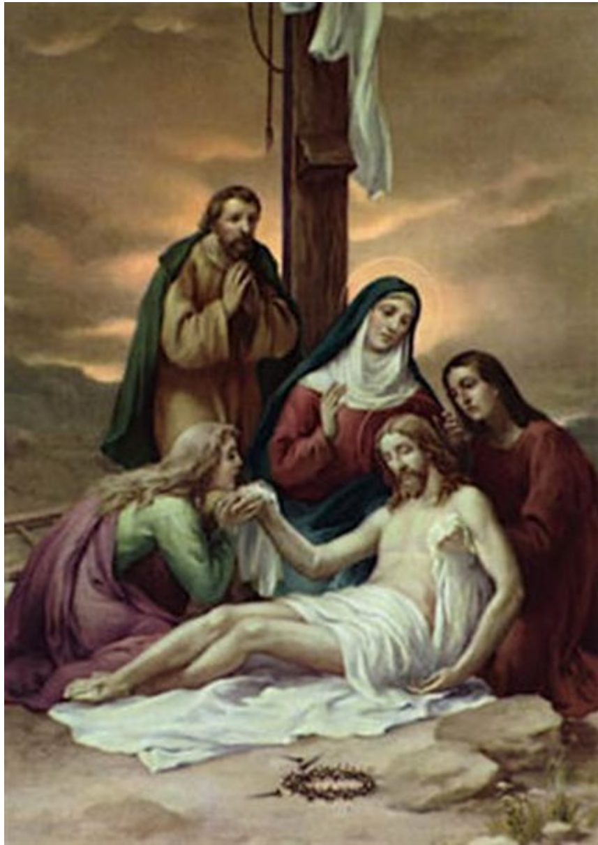
STATION 13: JESUS IS TAKEN DOWN FROM THE CROSS