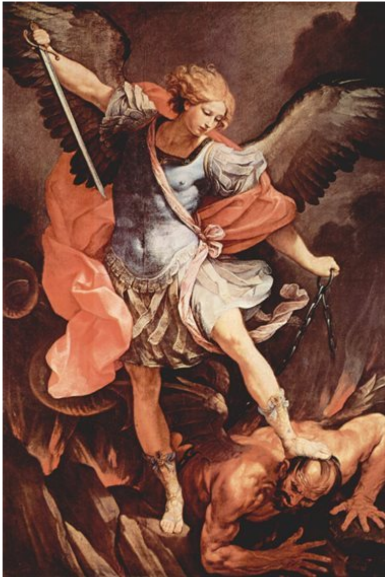
SAINT MICHAEL THE ARCH-ANGEL CRUSHES SATAN