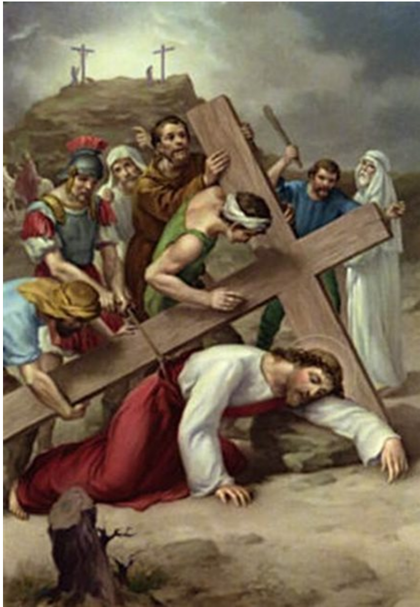
STATION 9: JESUS FALLS A THIRD TIME