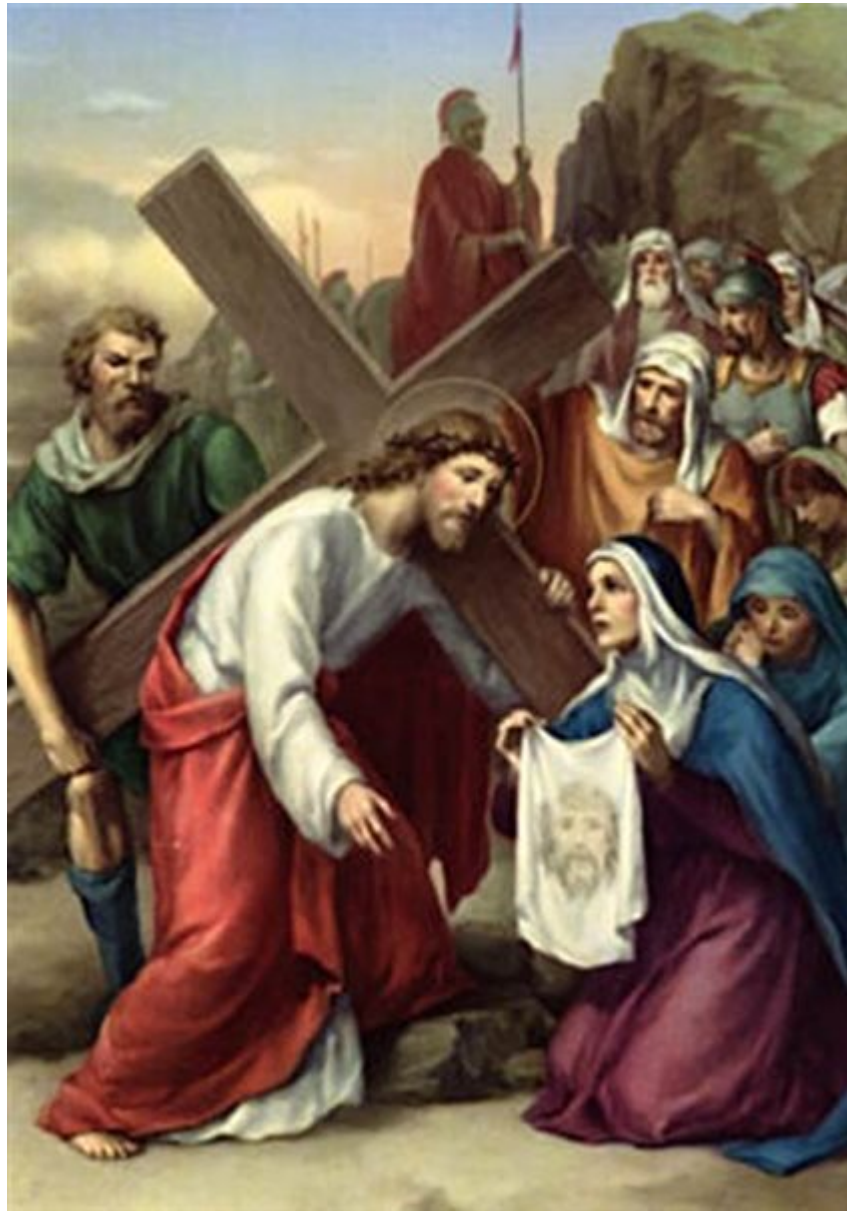
STATION 6: VERONICA WIPES THE FACE OF JESUS