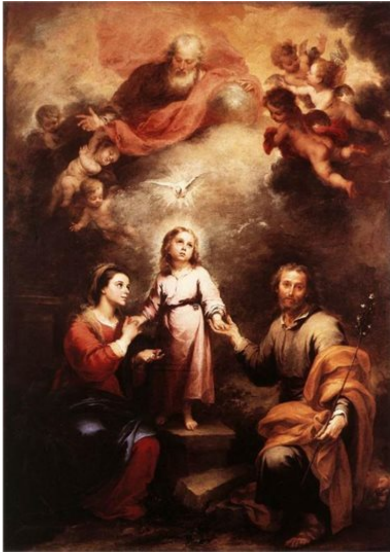
THE HOLY FAMILY