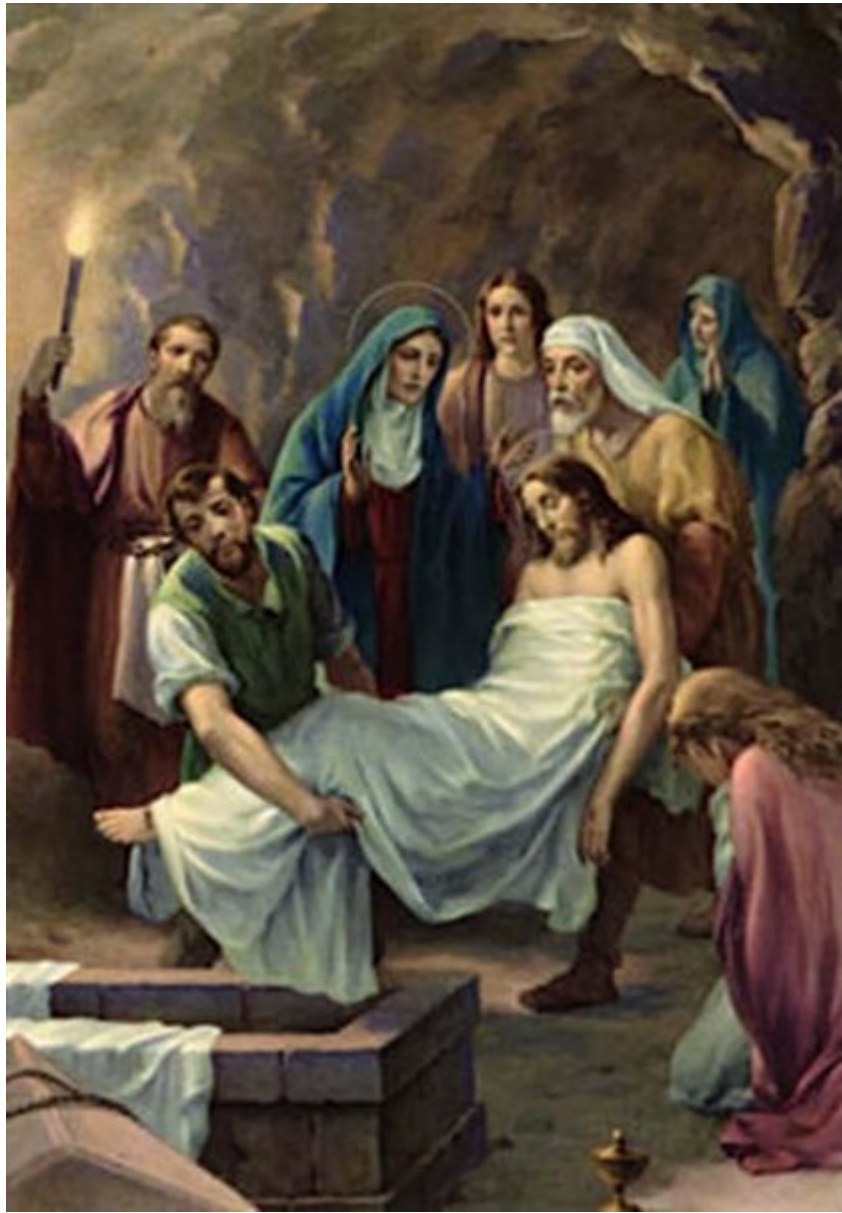
STATION 14: JESUS IS PLACED IN THE TOMB