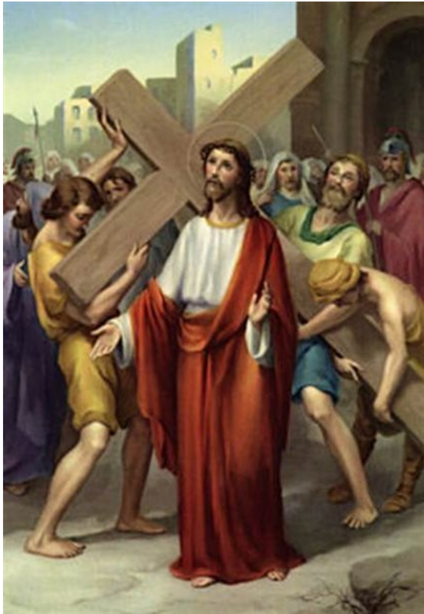
STATION 2: JESUS BEARS HIS CROSS