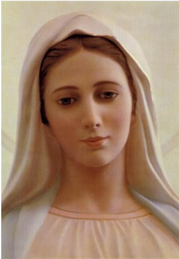
MARY THE MOTHER OF JESUS CHRIST