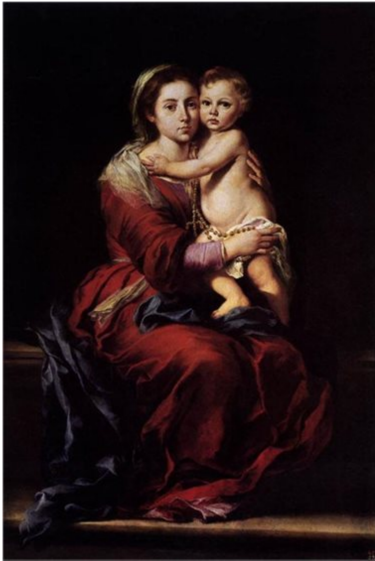
THE BLESSED VIRGIN MARY AND BABY JESUS